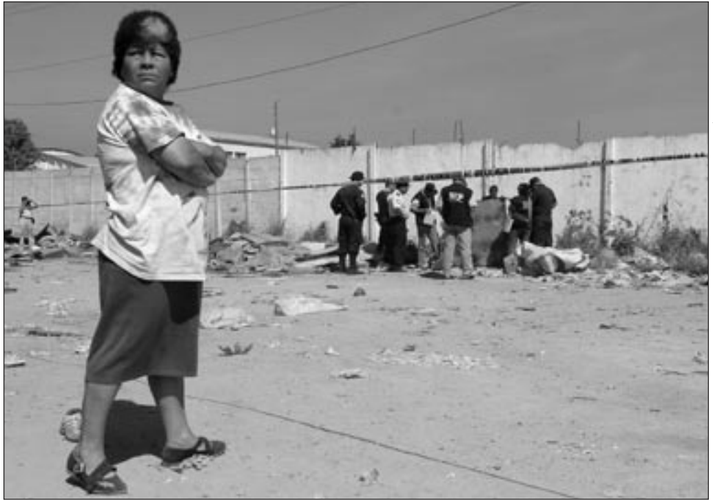
A neighbor observes as the police investigate at the scene of a murder of an unidentified woman in Guatemala City, Guatemala, Friday, November 25, 2005. According to the police, 580 women were murdered in Guatemala that year.