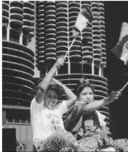
Guatemalan ethnic pride parade in Chicago, IL