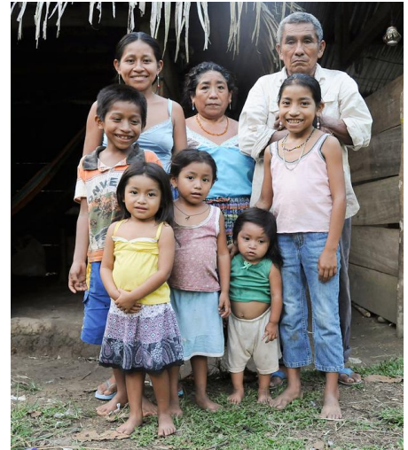
Scholarship recipients and their family

We also distributed funds to five Guatemalans living in the US who work to educate the public about human rights abuses in Guatemala and organize members of their community to advocate for the rights of Guatemalans in the United States.