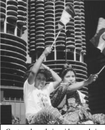
Guatemalan ethnic pride parade in Chicago, IL