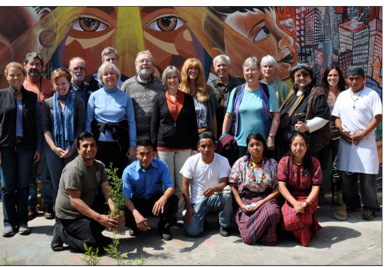
November delegates from the Unitarian Universalist Church of Arlington meet with communities affected by migration and deportation in Café Red, run by DESGUA, in Quetzaltenango.

By far the highlight of the trip, (if I can boldly speak for my fellow delegates here)