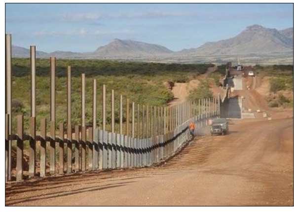
Patrols at the US-Mexico Border

In a July 1 speech at American University,