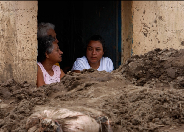
Amatitlan, Guatemala: Overflow from the Mixco river that half-buried the front door to this house.

Under US immigration law, a country can apply for TPS if it has suffered from largescale natural disasters. TPS would allow thousands of Guatemalans to remain in the US to work. Approximately 1.2 million Guatemalans live in the US, 60 per-