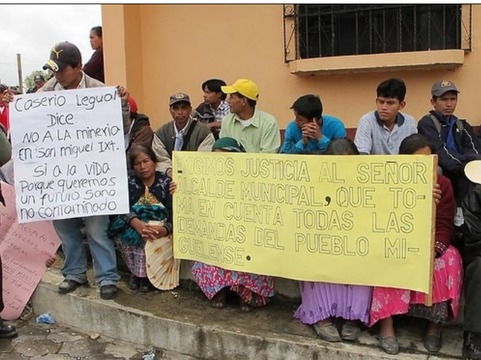
Residents of San Miguel express their opposition to the mine to local officials.

On June 3, GHRC joined with Rights Action and the Center for International