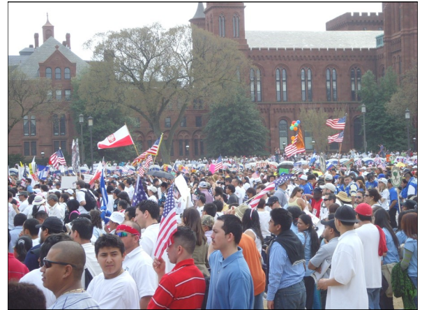
Thousands fill the National Mall to support a comprehensive immigration reform

Major concerns over current deportation measures include the incarceration of documented workers and the separation