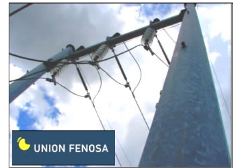
On its website, Union Fenosa advertises its commitment to social responsibility and the investment it makes in communities. The company, however, has not taken steps to resolve the conflict in San Marcos.

Under the pretense of preventing further violence, Guatemalan President Álvaro Colom declared martial law in San Marcos on December 22, 2009. All meetings and