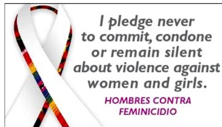
MIA's White Ribbon Campaign against femicide.

tary family, I was ashamed to know that my family could have been part of this gender violence. By 2004, I needed to become more directly involved with ending femicide. In 2005 I founded MIA, Mujeres Iniciando en Las Americas (Women Initiating in the Americas) to help end this injustice. As founder and Executive Director, I work with students and others here in the US raising consciousness about the sad reality that our