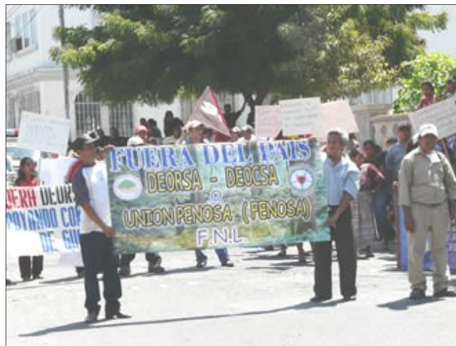
"Get out of the country" Community members from San Marcos protest excessive price hikes of Spanish energy company Union Fenosa and subsidiaries DEORSA-DEOCSA

Three organizers working to broaden public access to electric power in a desperately poor area of Guatemala have been murdered in the past five months, as entrenched power companies resist grassroots efforts to create a municipal electricity company. None of the murderers has been apprehended, while martial law has been declared in the area under the pretense of preventing further violence.