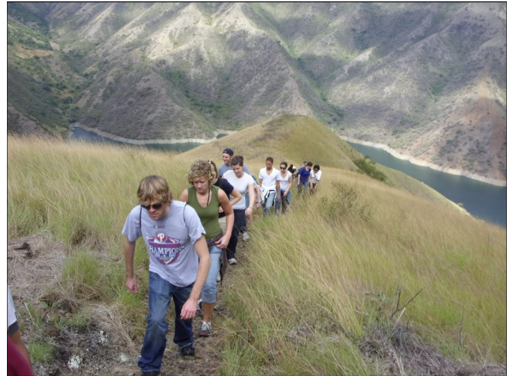
Students make the steep climb up from the community of Río Negro to the site of the massacre of 177 women and children.

Upon return to Washington, DC, GHRC delegates wrote and delivered a letter in support of comprehensive reparations to President Colom during his visit to the Organization of American States in February 2010. The delegates also met with the Inter-American Commission (IACHR) to deliver their letter in support of moving the Río Negro case to the Inter American Court in Costa Rica.