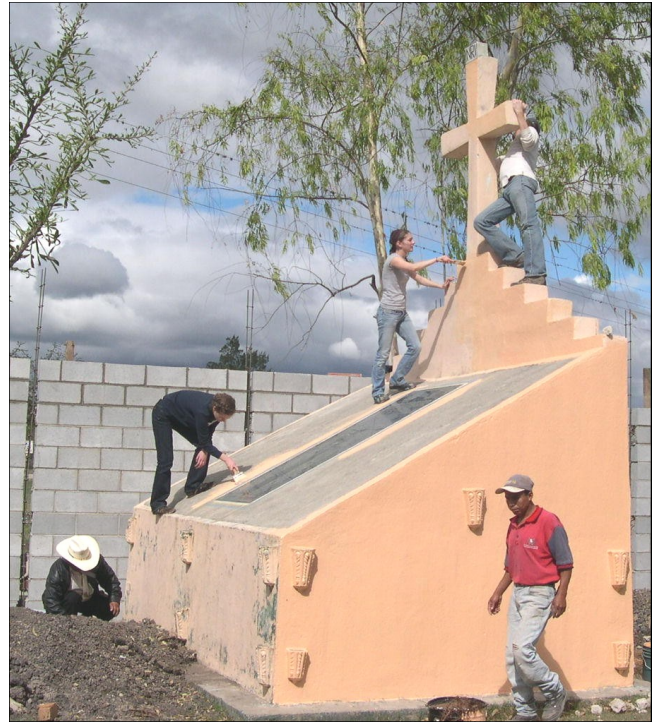
American University students, at the request of local community members, paint one of the five large monuments in the Pacux cemetery that commemorates the massacres of Río Negro in 1982.

The delegation then traveled to Río Negro, six hours north of Guatemala City, by highway and dirt road, to Pueblo Viejo. Because the National Institute for