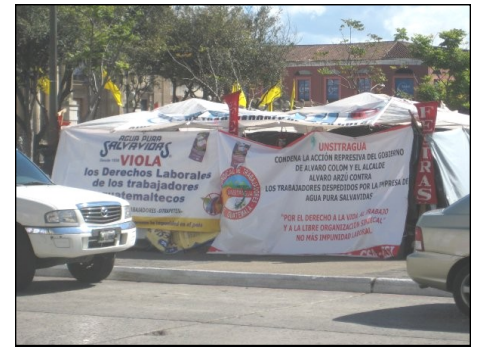
SITRAPETEN workers protest in Guatemala City's Central Plaza. They were violently evicted on International Human Rights Day.