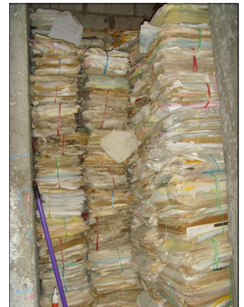
Stacks of documents at the Police Archive wait to be sorted and analyzed. 80 million documents were discovered in 2005

For many family members seeking information on the disappeared, the document has provided the impetus to push the case through the court system.