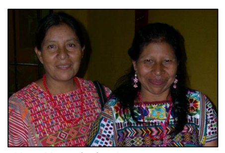
Mama Maquín leaders, Ixcán

The "Women's Sector" brought the voices of Guatemalan women to the Peace Accords process. They organized 25,000 women in a National Women's Forum to raise awareness of women's rights and build a national feminist movement in Guatemala. "Our goal was to form a diverse movement of Mayan and Ladina