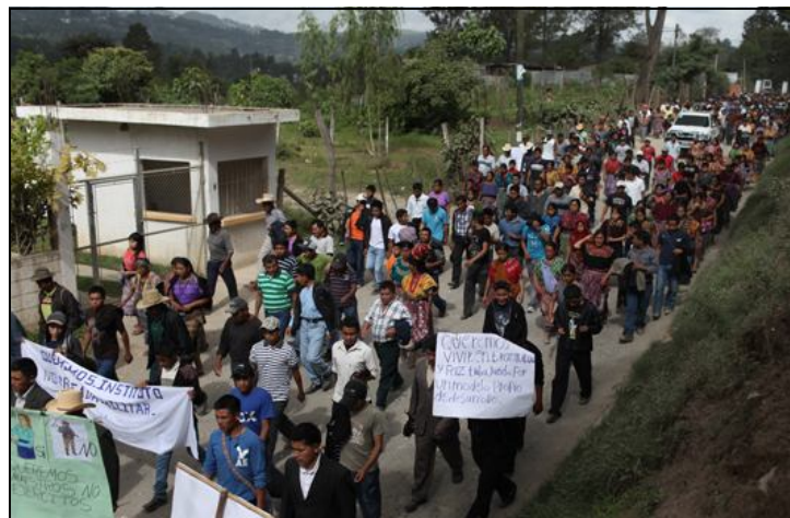
March in San Juan Sacatepéquez

Barillas Lifted President Pérez Molina lifted the siege after 16 days and 17 arrests, nine of which were declared to be illegal by the UN Office of the High Commissioner for Human Rights. The president