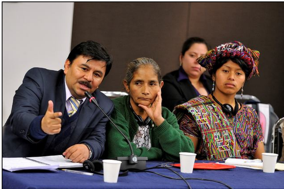
Continued from page 7

While the government, not surprisingly, denied the legitimacy of the majority of the petitioners' concerns, the presentation did bring out a minor concession by Hugo Martínez of the Presidential Human Rights Office. "There hasn't been complete fulfillment of the spirit of the Global Agreement on Human Rights," he admitted.