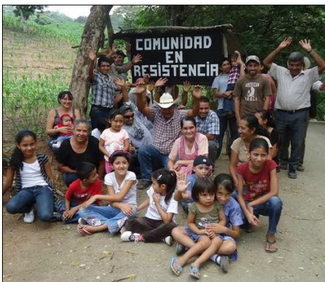
Residents of San José del Golfo and San Pedro Ayampuc declare themselves a "Community in Resistance."