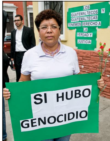
“Genocide did happen.”

The international community mobilized in support of the Directorate. GHRC had met with staff of SEPAZ in March and quickly issued a press release expressing profound concern. The statement urged the government to reestablish the Directorate, reinstate the formal collaboration between the Archive and the Public