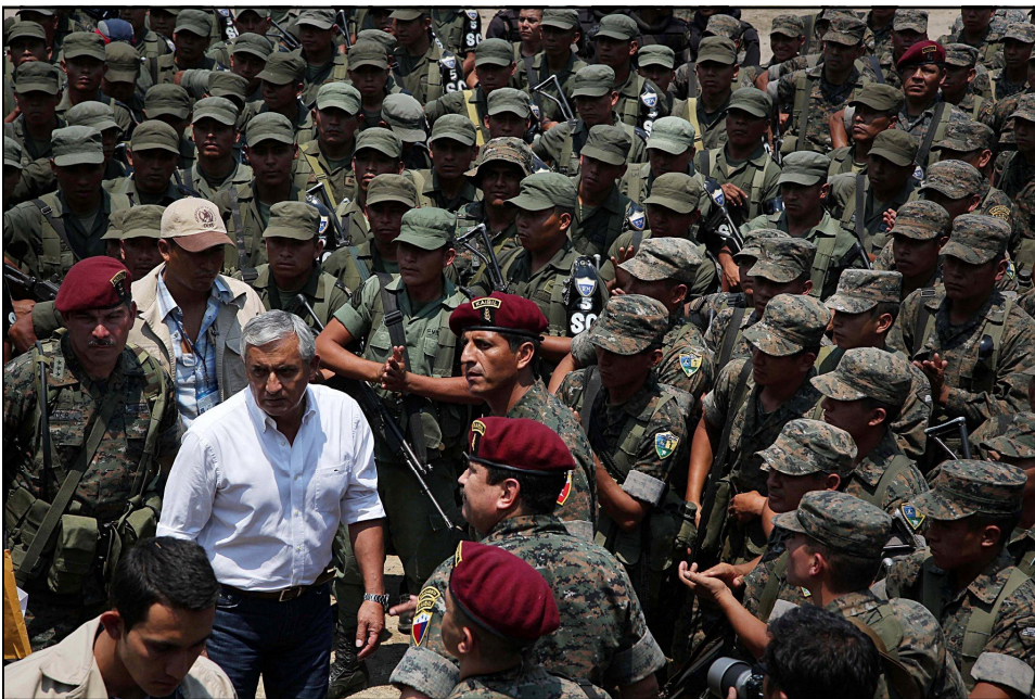
President Otto Pérez Molina in Santa Cruz Barillas, [Photo: PlazaPublica]

Soldiers and police also descended on the villages, kicking down doors without warrants, tearing through houses, overturning tables, spilling food, confiscating personal papers, terrifying – even hitting – the children. Men and women were separated for questioning, in a tactic frighteningly reminiscent of the counterinsurgency tactics used during the armed conflict. Security forces sexually harassed the women and threatened them with rape. Massacres survivors felt as if they were reliving the horrors of the war.