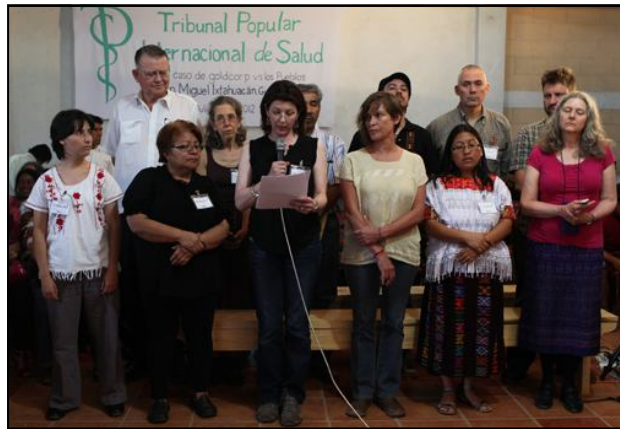
The People's International Health Tribunal

June 15: Government Responds to Campesino Demands The government responded by email to a list of eight demands presented by the Indigenous March. Among the responses were the commitment to not install new military bases in areas where the population, along with the authorities, do not want them; a reduction of interest on the agrarian debt; and a commitment to look over mining laws. Leaders of the Indigenous March plan to present a counterproposal.