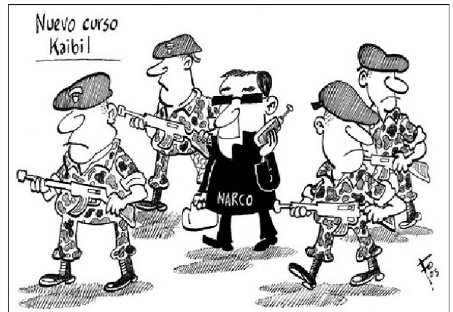
"New Kaibil Course" Cartoon from enclavedefo.blogspot.com

Equally troubling is the fact that the most