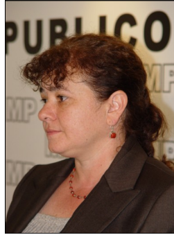
Dr. Claudia Paz y Paz

Since then, two more criminal complaints have been brought against large groups of supposed members of the guerrilla movement for acts committed during the internal armed conflict. Both complaints read as a who's-who of the human rights com-