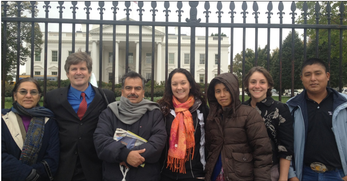
GHRC staff and interns with representatives of the communities of the Polochic Valley in front of the White House

Meanwhile, there has been no justice for the three community members who were killed during, and after, the evictions.