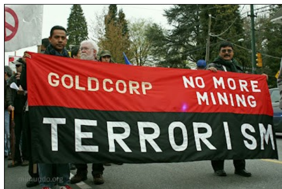
Protest in Vancouver, British Columbia denounces GoldCorp's mining practices in Sipakapa, San Marcos.

Residents have already seen the destruction and illness the mine brings as well as the lack of local development. They did not need economists from the US to point out these facts of their life. Nonetheless, the report can help sway the tide of international opinion away from the irresponsible and unsustainable mining project and lend support to the surrounding communities fighting for their health, land, and the wellbeing of their families.